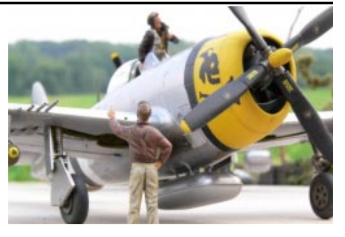
The third kit is the Academy P-47D-25 with the Pyn-Up decals of the 56th FG showing "Shack Rat". It was the test bed for the new techniques.

The second kit is a Tamiya P-47D-30 depicting Glenn Eagleston's aircraft. It is only weathered slightly. It represents the type of finish seen on most jets.