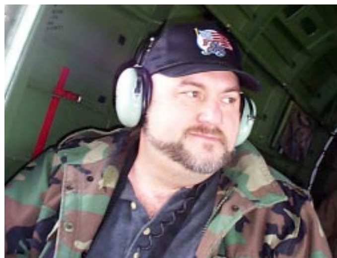
A satisfied passenger!