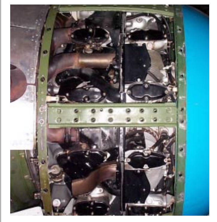
Engine and exhaust details.