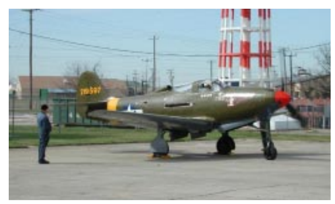
Starting up the P-39 for a flyby that never happened.