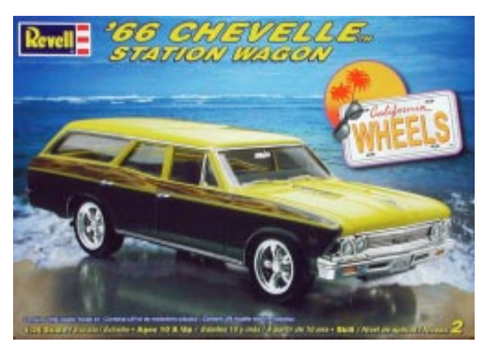
The wagon is, for the most part assembled exactly the same way as its counterpart SS 396 coupe, but I did notice that the engine is done the old fashioned way of the entire engine is assembled and put into the chassis and then the front end is assembled BEFORE the chassis is attached, for my taste I like the way the previous SS 396 was done.

Another thing I like about these kits is there is very little flash or anything more to prepare to build them than soaking them in a detergent to remove the residue from the mold to have the paint adhere, and paint it the color you desire and I use Tamiya colors because it dries so fast and I can begin to work on it, although now I generally let it dry or cure for a week or so before beginning. Since I have been using model building as a kind of therapy since my accident on May 31, 2004, I am only able to work on a model for about 3-4 hours at a time so when I paint something it is given the proper time to dry and it usually turns out much better than my models used to look, now they are looking much better.