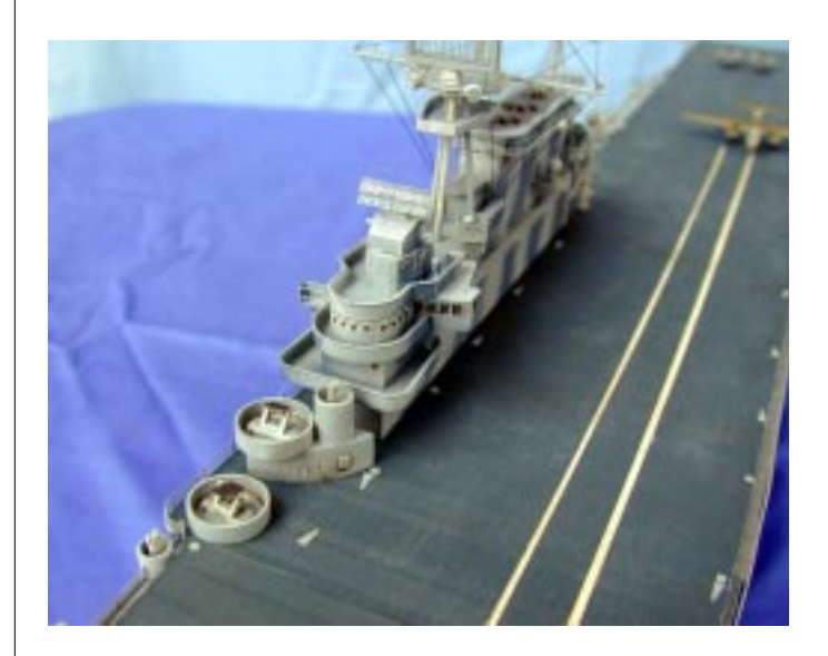
(continued on page 10)

I assembled the ship's Island and deck structures following steps 10 through 13, cleaned up seams, and shot everything with haze gray. I then applied the wavy Navy blue camo scheme to the island freehand with an airbrush. At this point I went to Tom's details instruction sheet. I had pre-painted the PE haze gray. I added extensive railings to the island following Tom's instructions. I basically crossed off the assembly steps as I went through the rest of the build. I then assembled the ship's masts following step 12. Use care with the main mast assembly, as there are some alignment issues when you place it on the island. I got mine close but the assembly "wants" to lean forward as the parts fit. I then assembled Tom's radar antennae and added them to the island. I fudged on the air search radar and went with the impressive CXAM array that was actually used after the Tokyo mission. Hey, I am having fun here! I then rigged the island masts with darkened .006 brass wire using Tom's illustration as a guide. I added just enough wires to "represent" the rigging without killing myself.