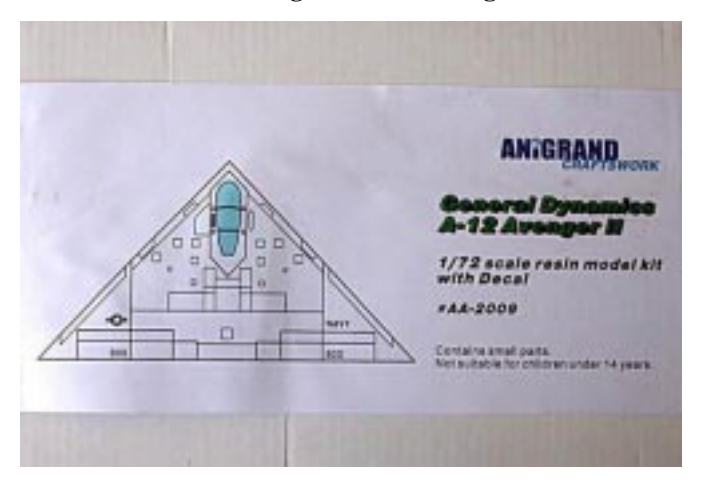
Price: $48. Obtained through DCM Models in the U.S. Also carried by NKR Models in Australia ($50 AUS).

E-mail: anigrand@email.com Web: www..geocities.com/anigrand