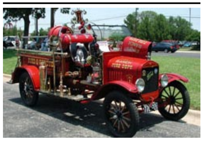
Model T Fire Truck seen at an antique /classic car show.