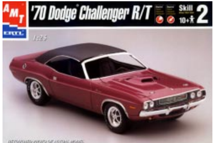
ALTOSCIALS PARATO OF ADDRESS MODEL

This month I am doing two MOPARs, one is an oldie but a goodie, a blast from the past. This is one of my all-time favorites from AMT/ERTL, kit#6466, '70 Dodge Challenger R/T (which I think stands for Road and Track). The kit comes molded in the ever popular gray that all of the AMT/ERTL kits come in.