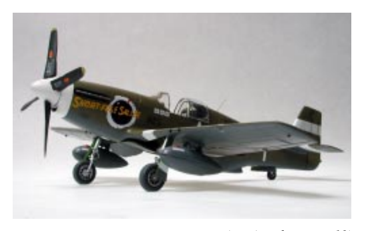
(continued on page 10)

You are a modeler; don't even think about using decals! They probably fit the Tamiya kit anyway. The dimensions and placements of the E.T.O. and M.T.O. wing and tail ID stripes for Mustangs can be found in a book by Roger A. Freeman called Camouflage & Markings, North American P-51 & F-6 Mustang, U.S.A.A.F., E.T.O., & M.T.O., 1942-1945. The wing and tail plane ID bands (white on green airplanes, black on silver