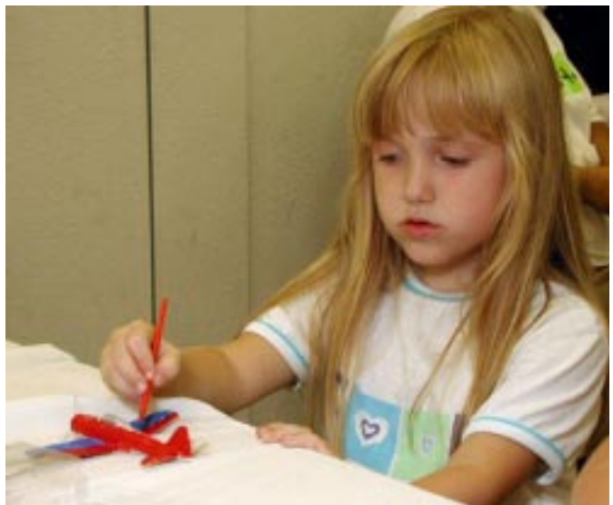
A red and blue Zero! Who wants to call the "color police?" Not me. She built it and she decided what colors it should be.