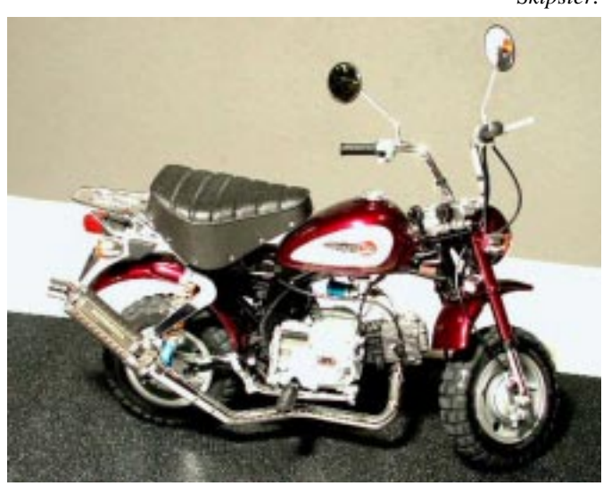
Motorcycle from the Austin Scale Model Show 2001.