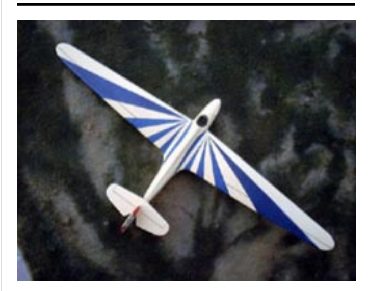
What? Floyd built this? But it's not an Me 109. Full story later in this issue.